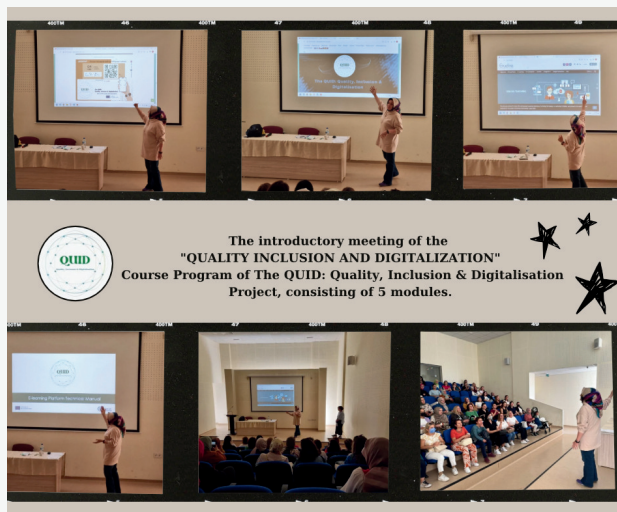
The introductory meeting of the "QUALITY INCLUSION AND DIGITALIZATION" Course Program of The QUID: Quality, Inclusion & Digitalisation Project, consisting of 5 modules.