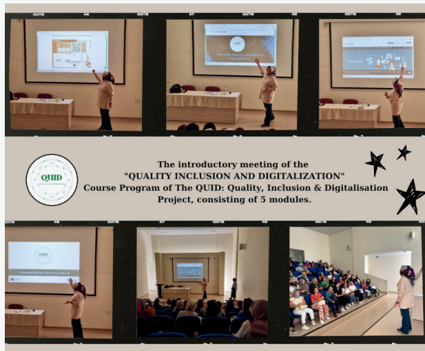
The introductory meeting of the "QUALITY INCLUSION AND DIGITALIZATION" Course Program of The QUID: Quality, Inclusion & Digitalisation Project, consisting of 5 modules.